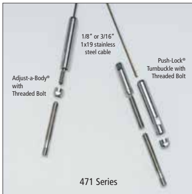
Series 471 Kits

The tensioning devices are an Adjust-a-Body® with Threaded Bolt, which threads into the metal post on one end, and a Push-Lock® Turnbuckle with Threaded Bolt on the other end.